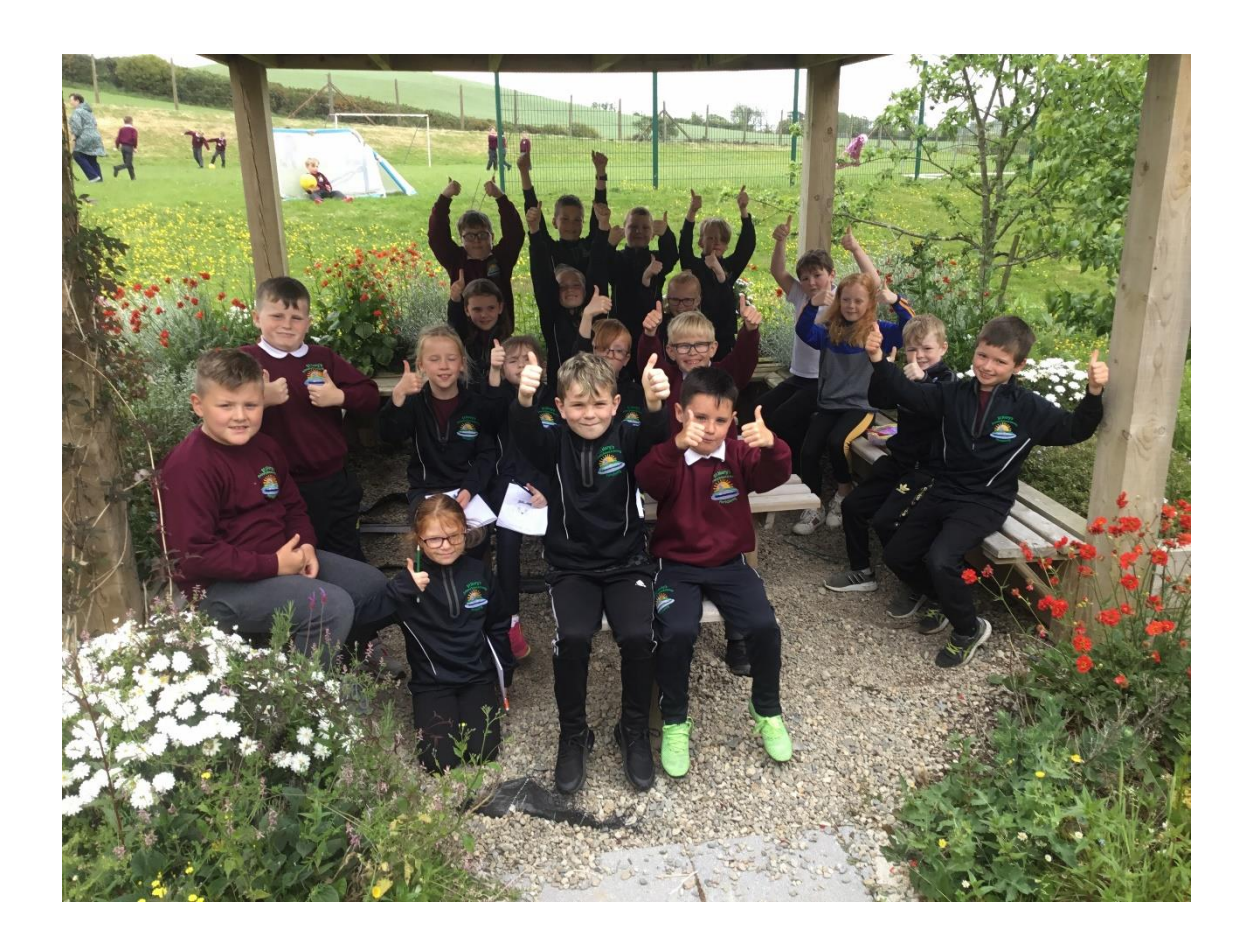
Saint Mary's Primary School and Nursery Unit 53 Windmill Hill Portaferry BT22 1RH